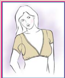
Jersey Knit Valara